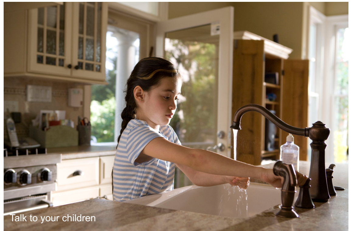
Talk to your children